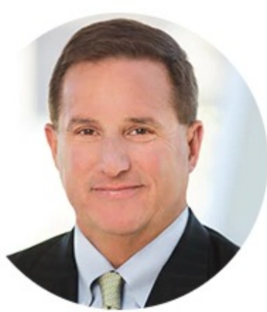
Mark Hurd Chief Executive Officer, Oracle