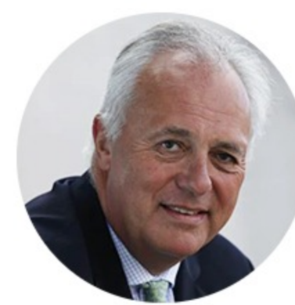
Lord Mark Malloch-Brown Former Deputy Secretary-General, United Nations