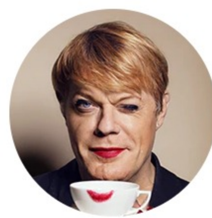
Eddie Izzard Comedian, Actor, Author