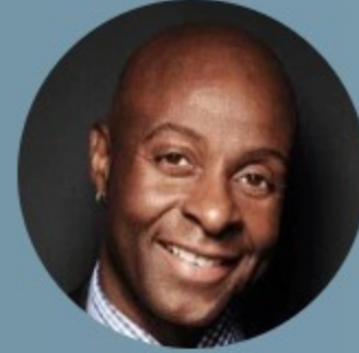
Jerry Rice Pro Football Hall of Famer