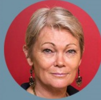
Tracy Edwards Author, Adventurer, British Sailor