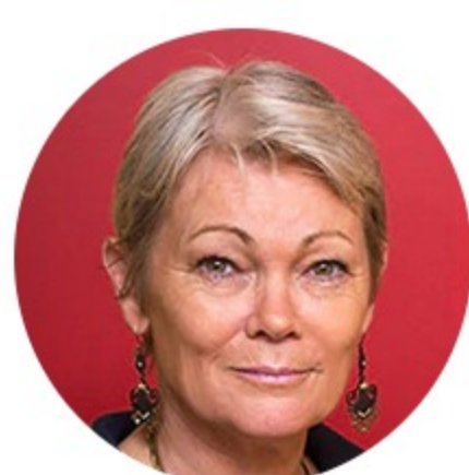
Tracy Edwards Author, Adventurer, British Sailor