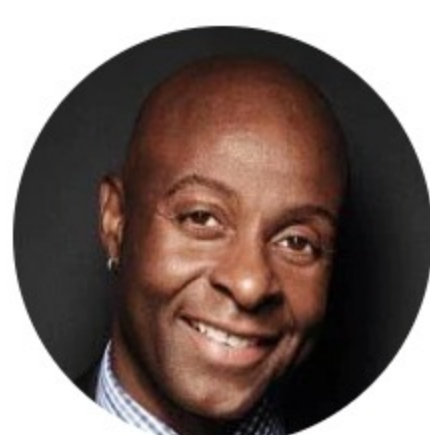
Jerry Rice Pro Football Hall of Famer